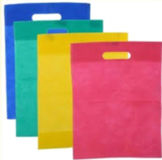
Non- woven Bags.