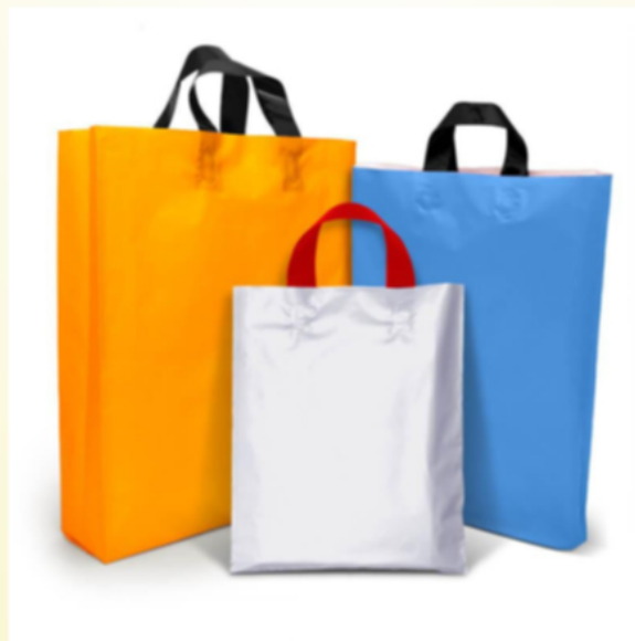
Plastic Bag or Non- woven Shopping Bags