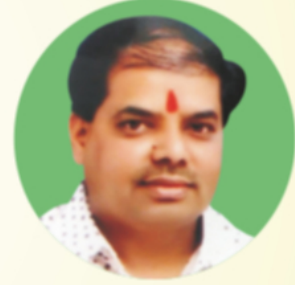
Shri Pravin Pote-Patil

Minister for Environment, Maharashtra State