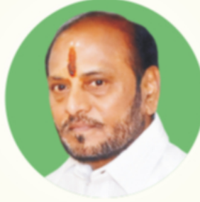
Shri Ramdas Kadam

Hon'ble Chief Minister, Maharashtra State