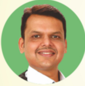
Shri Devendra Fadnavis

Hon'ble Chief Minister, Maharashtra State